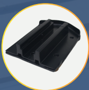
Sunstack Base SS01-BS1-00