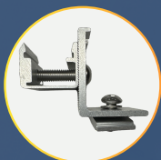
L Foot, Slide Plate & Rail Bracket SS01-SPLR-00