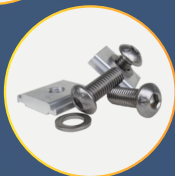
Slide Plate, Washer & Bolt SS01-SP1-00