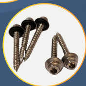
M6 Fasteners SS01-WS660-00