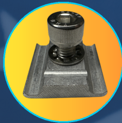
MLPE Clip SS01-RMC-00