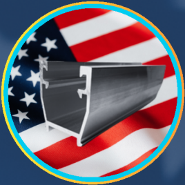
Integrity Rail SS01-R186-00 SS01-R186B-00