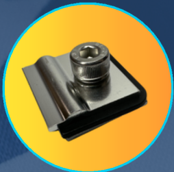
Grounding Clip SS01-RGW-00