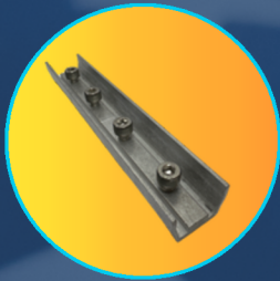
Structural Rail Splice SS01-RS-00