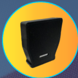
End Cap SS01-ECP-00