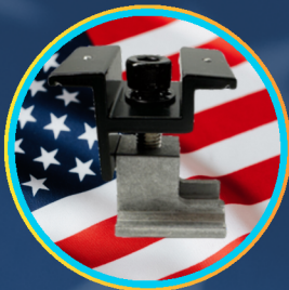
Universal Rail Clamp SS01-RC-00